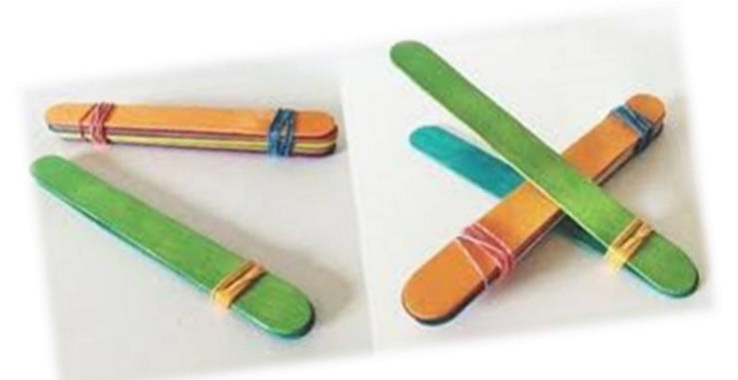
BUY IT NOW LINK: <u>Click here</u> Cost £5.99 for 300 lolly sticks from Amazon

These can be used when growing seeds or to name types of pot plants.