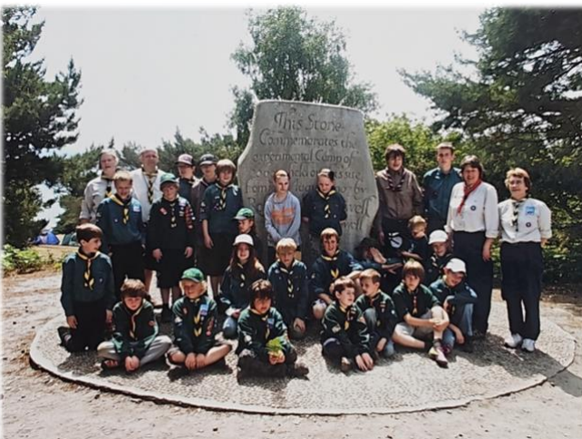
Brownsea Island c.2011.