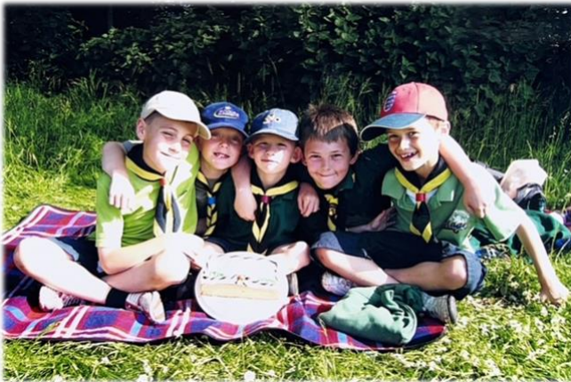
Cubs 90 th Anniversary c.2006.