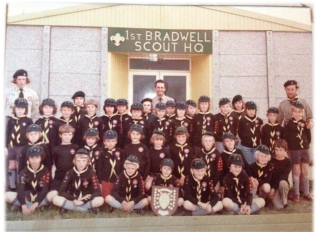
Wiltshire Trophy Winners c1965.