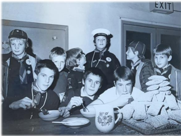
Shredded Wheat Challenge c.1983.