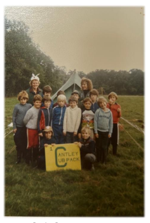
Cub Camp c.1980.