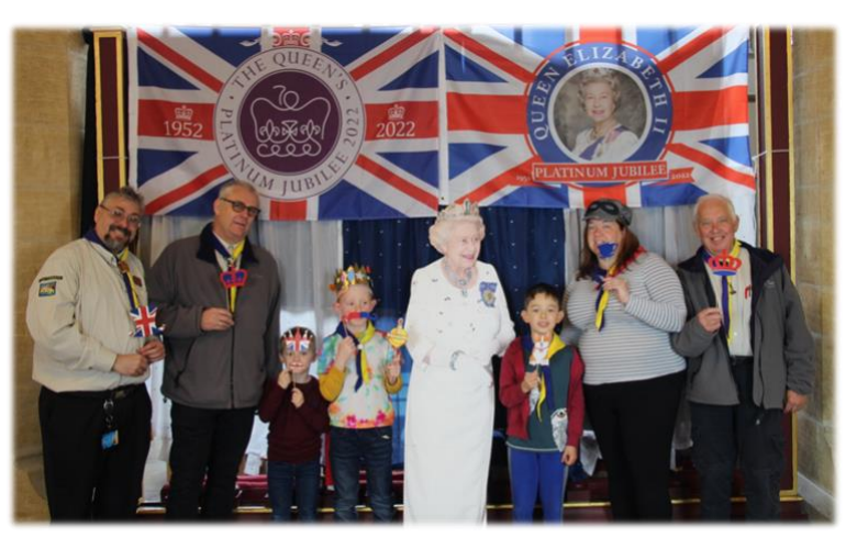
At the Jubilee Party c.2022.