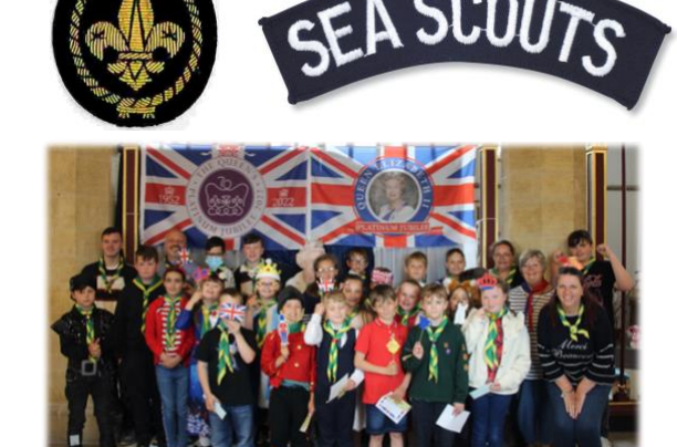
The Jubilee Party c.2022.