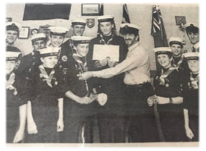
Chief Scout Award presentation c.1985.