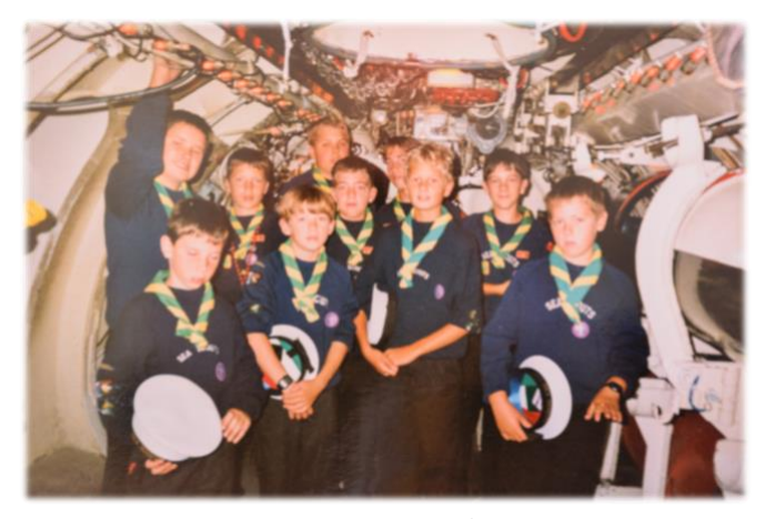
Scouts on a submarine c. 1999.