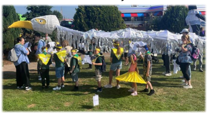
The Arts Festival c.2024.