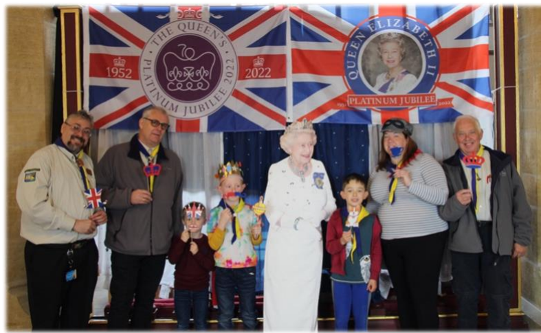
The Jubilee Party c.2022.