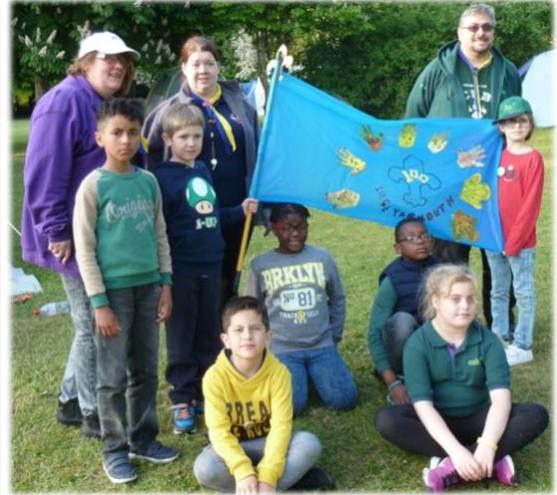
Cub Camp c.2016.