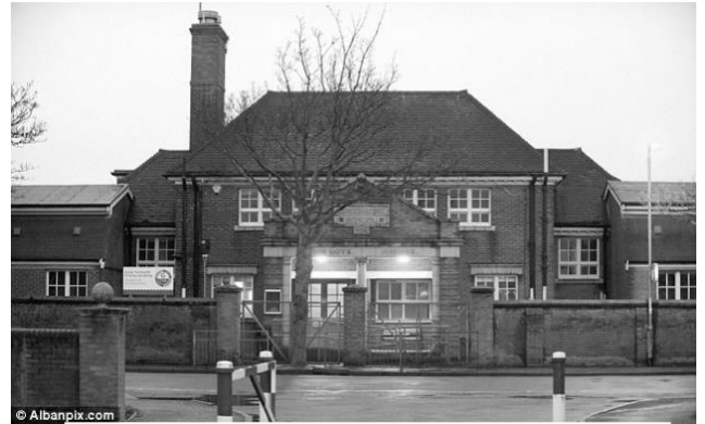
Greenacre School (2002-2014).