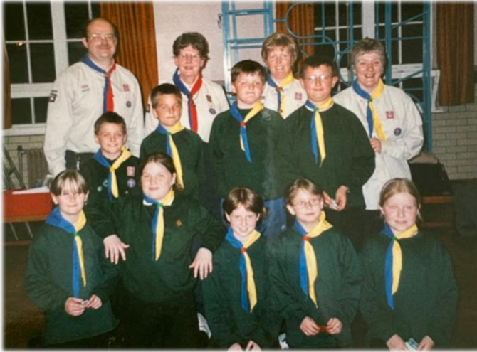
Cub Pack c.2002.