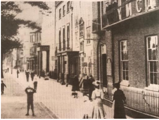
Y.M.C.A. South Quay (1910-1914).