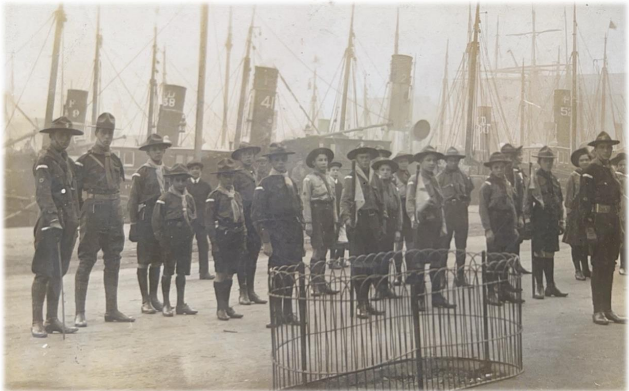
The first known group photograph depicting the 1 st Great Yarmouth Annual General Meeting Parade on South Quay c.1911.