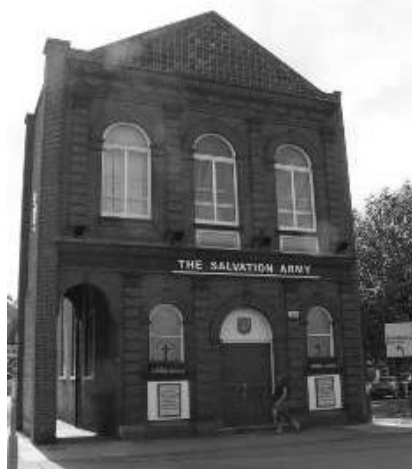
The Salvation Army Citadel (2014-date).