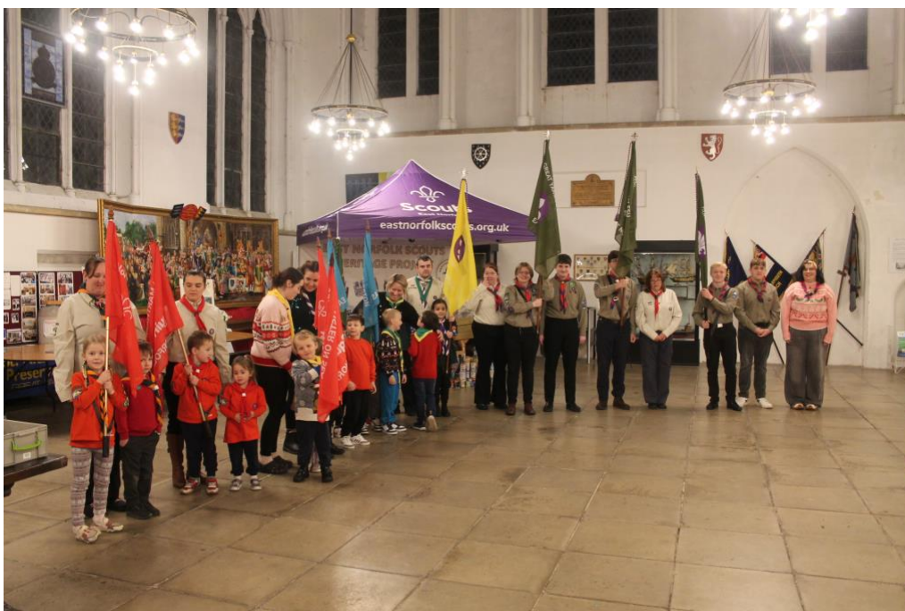
Dedication of the new Flags at the Festive Event 2024.